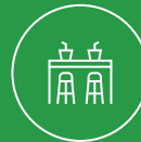
Restaurants & Cafe