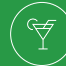
Cafe & Juice bar