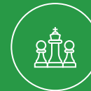
Open Air Chess