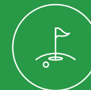
Open Air Golf Simulator