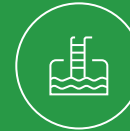
Infinity Swimming Pool

Meticulous attention to detail has been paid to every aspect of the building to make it the most desirable and convenient place to stay either short term or long term.